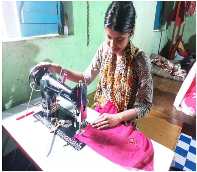
Girls learned tailoring