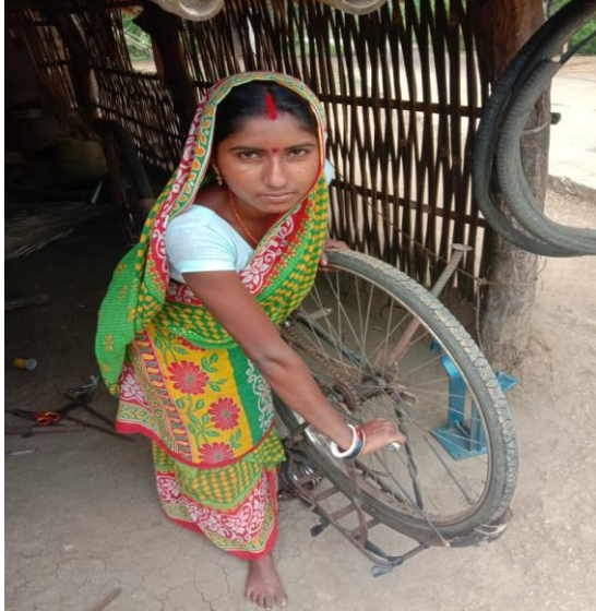
Women learned repairing by-cycle