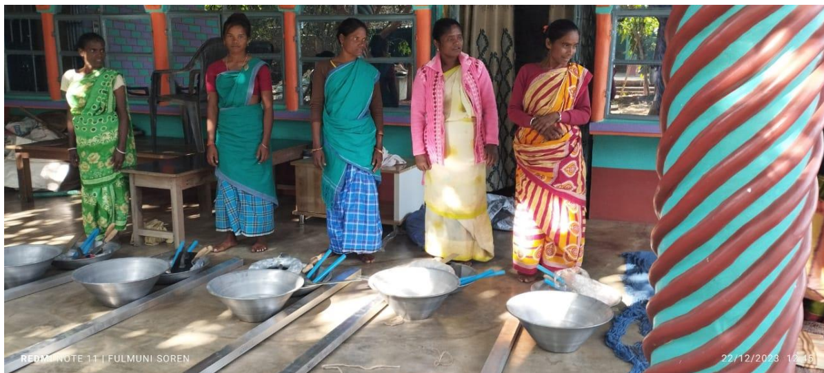
Women with Masonry equipments