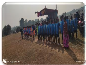
Empower & leadership building of Adolescent Girls by Promoting Leadership and conducting Football Tournaments for girls.

In an effort to promote economic empowerment, equipment and training were provided to women and girls in various income-generating activities. Four girls and 11 women received tailoring machines, with earnings averaging Rs. 6950/- per month. Additionally, four girls and 10 unmarried women were trained in bicycle repair, earning Rs. 5039/- monthly. Ten women trained in masonry now earn an average of ₹10,425 annually. Furthermore, 15 girls who passed their 10th exams are inspiring others to pursue education.